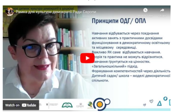
Video lecture from the blended course "Listening to children's voices: culture of democracy in preschool education"

The participants emphasized the high relevance of these courses both for the New Ukrainian School reform implementation and the situation of wartime when assuring access to quality education for all students is one of the top priorities: