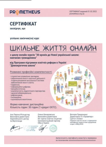
Course certificate and main poster from the MOOC "School Life Online"

"School life online" is a unique online course in the Ukrainian educational market that aims at explaining the concept of digital citizenship and demonstrate the relationship between digital and civic competences. It motivates teachers and school administration to create and maintain safe digital environment at school and promote the development of social and civic competences at the digital age. The course is in line with the New Ukrainian School reform and is based on the approaches, principles, and materials of the Council of Europe and European Wergeland Centre.