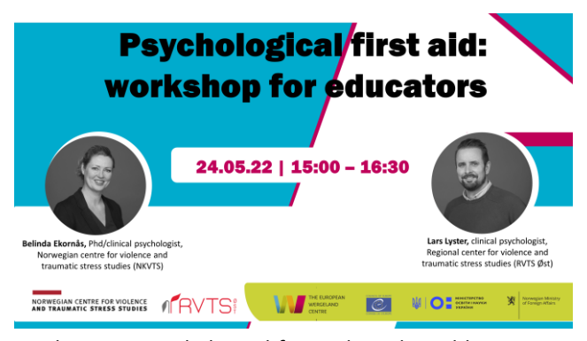
Webinar on psychological first aid conducted by NKVTS experts

The Programme joined the efforts with other relevant actors and produced materials to sustain well-being and learning capabilities of the Ukrainian children both inside and outside the country. Among them are the materials to support school and preschool teachers in their everyday work and get them better equipped for providing care and support to students. Involving leading experts from the Norwegian Centre for Violence and Traumatic Stress Studies (NKVTS), as well as psychologists from Ukraine giving advice on how to deal with difficult questions and reduce stress among children, the Programme produced various video resources to support both Ukrainian educators and parents. Among them is a series of videos and webinars for building psychological resilience of educators reflecting on the issues of crisis reactions, psychological support, and school adjustment. As a part of the emergency response for preschool education, the Programme produced a series of five videos to guide preschool teachers, parents, and caregivers at wartime . They provide information on the first psychological aid for children, give advice on how to deal with difficult questions, manifestations of anger, sleeping problems and nightmares, how to reduce stress, etc.