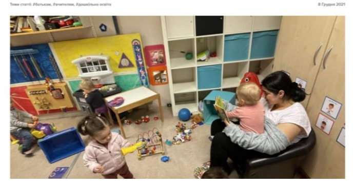
Illustration from the article on the New Ukrainian School Reform portal