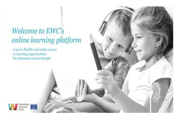
Screenshot from the EWC's online learning platform

"In such a difficult time, it is very important that every child has access to education. It is now, more than ever, necessary to learn new forms of interaction with students. Thanks to this course, I learned many new forms of interaction that I've never heard of before."