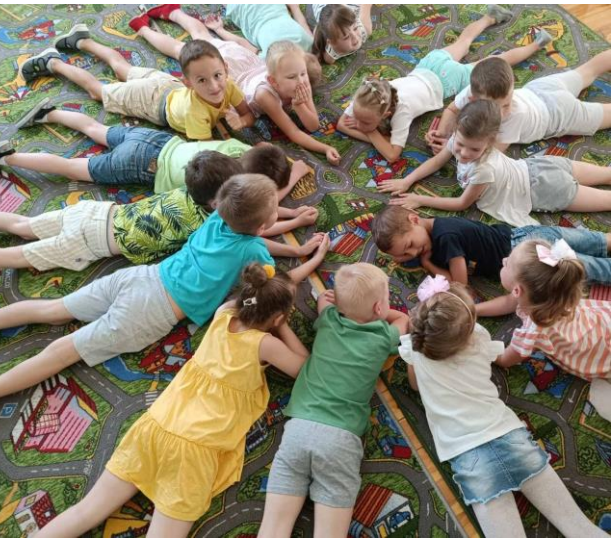
Mobile youth work meetings with preschool and school age children for both local and internally displaced children, teachers and parents in relatively safe regions of Ukraine