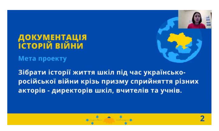
Working meeting on research project "Ukraine's Fight for Democracy: The Role of Schools at Wartime"

From the beginning of the full-scale war in Ukraine, the role of schools in local communities has changed. To document this change and assess its meaning for democratic citizenship and human rights, the Programme conducted a study "Ukraine's Fight for Democracy: The Role of Schools at Wartime" in collaboration with NIBR-OsloMet, V.N. Karazin Kharkiv National University, Research Bureau Sociologist (Kharkiv, Ukraine) and Lviv In-Service Teacher Training Institute (Ukraine). Based on 30 in-depth and 3 focus group interviews with Ukrainian teachers, school principals, and high school students, conducted between May – June 2022, the study documented witness stories on civic action of educators and students opposing Russian aggression in Ukraine.