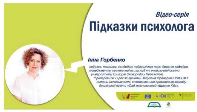
Video series "Supporting children at wartime: Tips from a psychologist"

All our blended courses contain a special MHPSS module providing course participants with relevant information on the first psychological help. The Programme produces new relevant resources, for example, videos and other learning materials, that are used for updating the content of the blended courses. We continuously monitor the needs of the Ukrainian educators and currently work on expanding our MHPSS package with the new materials produced by professional psychologist on the relevant topics.