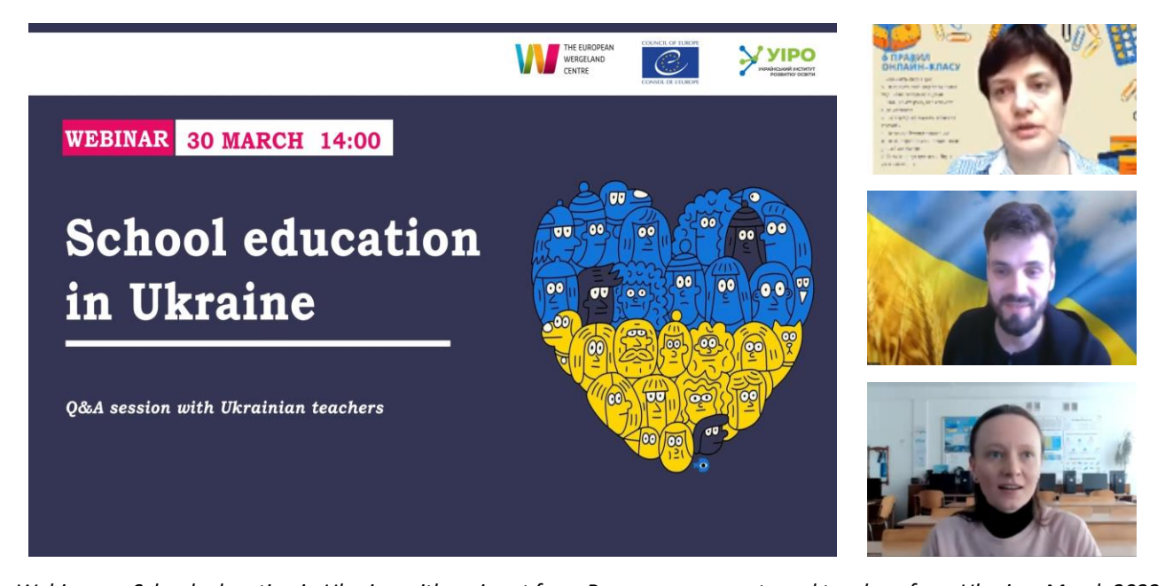
Webinar on School education in Ukraine with an input from Programme experts and teachers from Ukraine, March 2022

The Programme has been available for the Norwegian authorities, research institutions and civil society organisations having inquiries about Ukraine , its educational system, integration of Ukrainian refugee children in Norway, and other related questions. Oslo team held meetings with the Norwegian Directorate for Education and Training (Udir), Oslo Municipality, Norwegian Sports Federation, Norwegian Institute for Urban and Regional Research (NIBR-OsloMet), Fafo, Norwegian Centre for Violence and Traumatic Stress Studies (NKVTS), among others and created a <u>resource</u> page for institutions and educators working with Ukrainian refugee children in Europe.