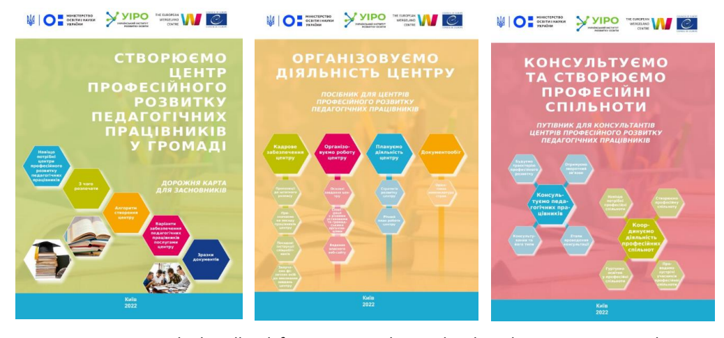
The handbook for CPD in 3 volumes developed in cooperation with UIED

The handbook consists of three volumes and responds to the most common questions on the main goals of CPD, their establishment and strategic development to strengthen local learning communities of educators. In 2023, the Programme has plans to develop and launch a special course on PLC for Ukrainian CPD in a close cooperation with our long-term partner Ukrainian Institute for Education Development (UIED).