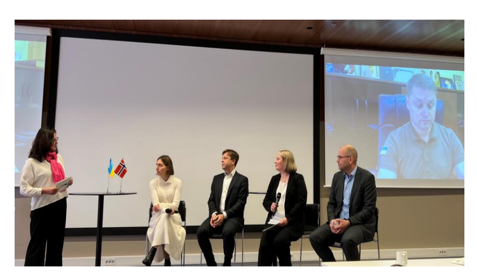
Breakfast seminar "Lifting up the Ukrainian War Generation: The Future of Ukraine Begins in Schools", Oslo, October 2022